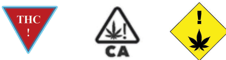
Figure 2. Comparison of THC/cannabis warning symbols. (left) Original California THC warning symbol as proposed in CDPH regulation § 40412(a) (California Department of Public Health 2017b). (center) Revised California cannabis warning symbol in emergency CDPH regulations § 40412(a) (California Department of Public Health 2017c). (right) Recommended alternative cannabis warning symbol.

Tobacco companies’ research on packaging color and consumer perceptions indicates that black is most visually prominent, particularly black text on a lighter background (Lempert and Glantz 2016). Red was specified in California’s proposed regulations (also Colorado, Oregon, and Washington regulations (Barry & Glantz 2017) and cannabis industry recommendations (Grossman et al. 2017)), but yellow more effectively gains and keeps attention, is perceived as less attractive, and signals a warning, especially with black text as in road signs (Lempert and Glantz 2016). A cannabis warning symbol emulating road warning style, color, and shape (U.S. Department of Transportation 2002) (Figure 2, right) would more effectively attract and maintain consumer attention. A cannabis leaf, as opposed to the more technical “THC,”